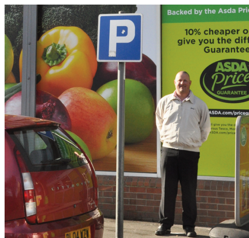
The new ASDA on South Road is taking trade away from struggling local shops