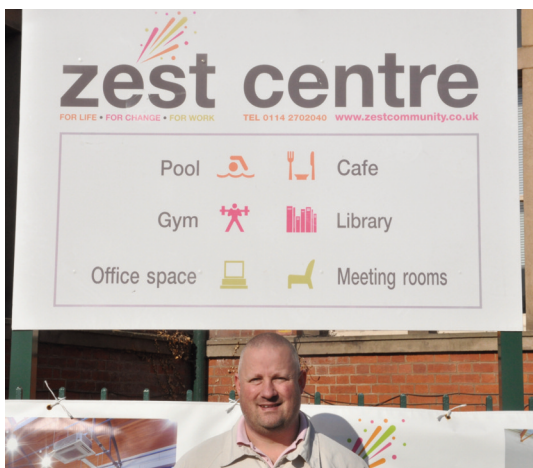
Zest – a vital service provider in Upperthorpe that needs maintained funding not cuts