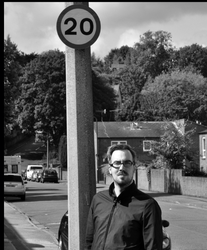
Ashberry Road, where children play out, is a dangerous cut through between Upperthorpe and Crookesmoor Road

Sheffield Young Greens were out in force for both universities’ Activities Fairs, speaking to new and returning students and collecting signatures for the ‘Fair Pay Campus’ campaign. Young Green Aodan Marken comments: “Polls show that 18% of young people now support the Greens. With the general election next May, it’s an important time to get involved!”