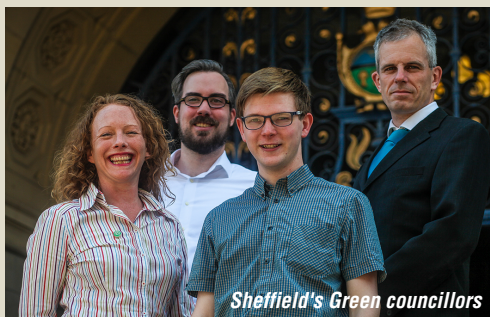
Sheffield's Green councillors

From bus chaos to tree felling, Sheffield's Labour Council isn't listening. Green councillors listen to local people and hold the council to account on your behalf. More elected Green councillors will mean a better Sheffield.