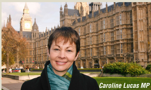
Caroline Lucas MP

From bus chaos to tree felling, Sheffield's Labour Council isn't listening. Green councillors listen to local people and hold the council to account on your behalf. More elected Green councillors will mean a better Sheffield.