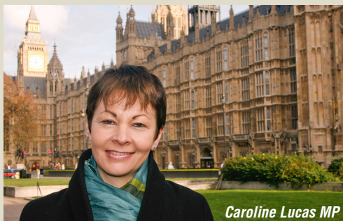
Caroline Lucas MP

From noisy late night venues in residential areas to protecting independent shops, Sheffield's Labour Council isn't listening. Green Councillors listen to people and small businesses in the city and give them a voice.