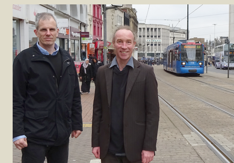
Chaotic bus changes last November highlighted a council that is not listening to people

We opposed plans for a new elected mayor, rejected in a 2012 referendum.