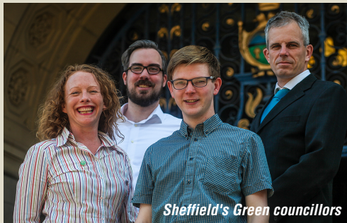
Sheffield's Green councillors

From bus chaos to tree felling, Sheffield's Labour Council isn't listening. Green councillors listen to local people and hold the council to account on your behalf. More elected Green councillors will mean a better Sheffield.